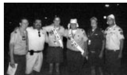
Top: Section Founder's Day float. Above: Distinguished Service Award recipients from S-4S at the Section Gathering. Below: Section members socialize at the Section Gathering.