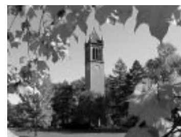
Iowa State University Bell Tower